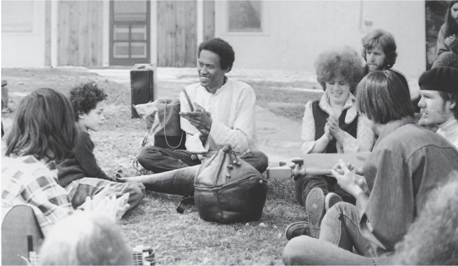
Don Cherry with students in the Spring of 1978